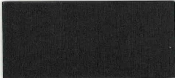
N005NN Noir Monochrom