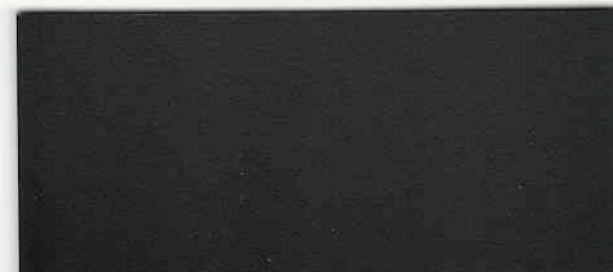
N005NN Noir Monochrom