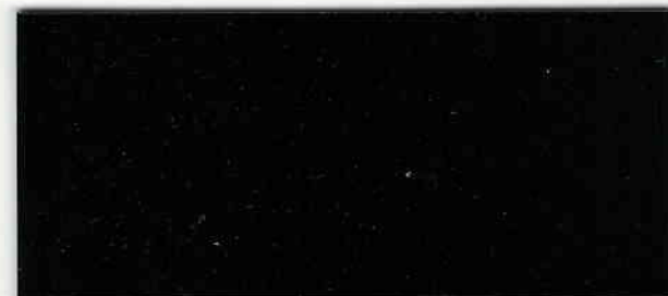
N005NN Noir Monochrom