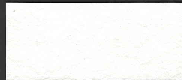
B070NB Blanc Megève Monochrom